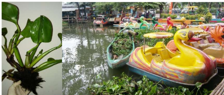
Figure 1. Water Hyacinth from Lake Situ Cipondoh, Indonesia.

Most of the 500 lakes in Indonesia have been covered with water hyacinth for years. For instance, Lake Rawa Pening in Semarang with an area of 2.670 Ha is one out of 500 lakes where water hyacinth has grown out of control and has caused many negative impacts to the environment and the society near the lake. Water hyacinth has grown out of control and has been interrupting water transport, power and tourism activity. Even more, it has decreased the population of aquatic lives in the lake. In 2002, 20% - 30% of the lake surface were covered by water hyacinth. In 2016, 60% of the surface area of the lake has been covered and contributed to at least 150.000 m 3 of sedimentation (Utomo, 2017).