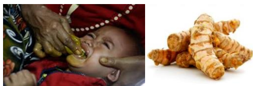
Figure 1. (a) Method of jamu cekok (b) Rhizome of temulawak

Malnutrition remains to be one of the most common public problems occurring in Indonesia. The prevalence of toddlers (<5 years old) suffering from malnutrition due to appetite problems was up to 53% (Indonesia's Ministry of Health, 2012). To accommodate the appetite problems in children, Jamu cekok a traditional herbal mixture is commonly applied for treating appetite problems in children. Cekok means a method of giving the herbal mixture into the throat of the children by force (Figure 1a). In most applications, Curcuma xanthorrhiza Roxb (temulawak or Javanese ginger, Figure 1 (b)) is used as the main ingredient of Jamu Cekok as it is known to be effective for increasing appetite in children.